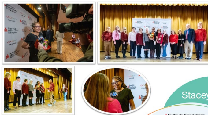
Original 2023 ADRP Annual Conference session slide

In conclusion, donor recipient events are not just inspiring the masses; they're redefining the narrative of blood donation. They remind us that behind every pint of blood is a story of hope, resilience, and the incredible power of human connection. As this initiative continues to grow, it promises to usher in a new era of awareness, appreciation, and engagement in the vital mission of blood donation.